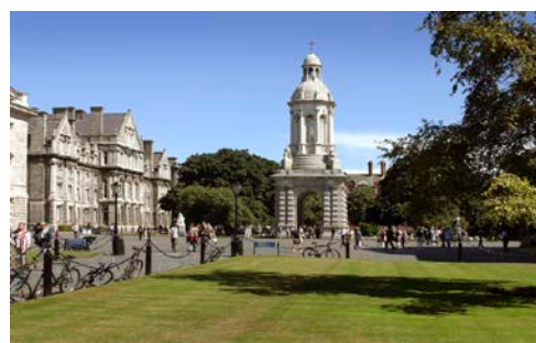
The Campanile, Trinity College

Trinity College: Morning class meetings will be held on the Trinity College campus. The Trinity College classroom will be the convenient staging area for a number of excursions into both the city of Dublin, as well as the surrounding countryside. On Fridays the group normally visits the Irish Film Institute (IFI). The Irish Film Institute is located in Temple Bar in downtown Dublin. Its mission is to preserve, present and promote film culture in Ireland.